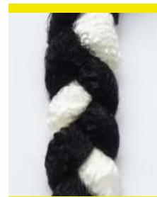
DRYTEX® DRYSPUN DOPE DYED BLACK